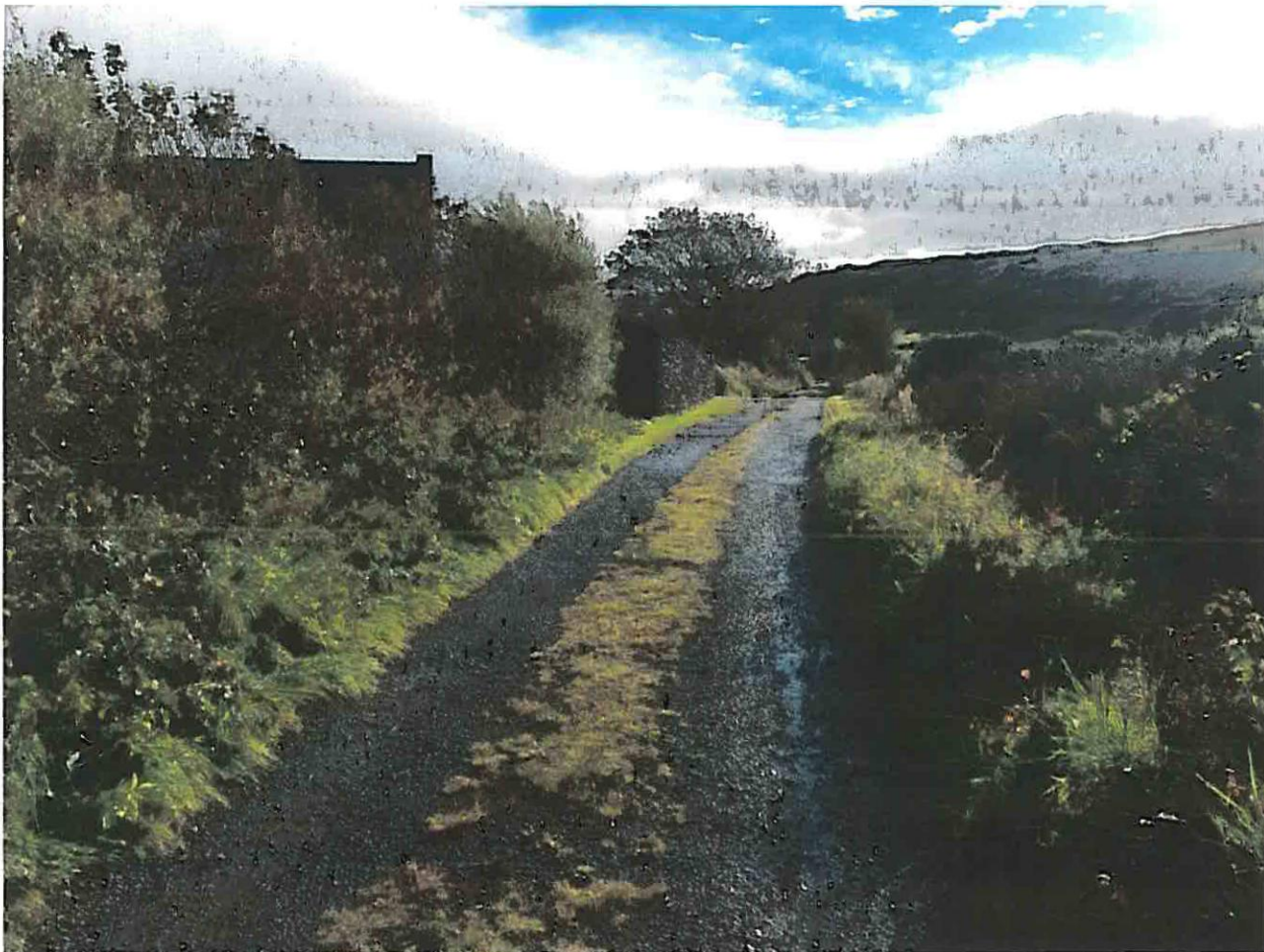
Western 200M length of Ballyganny Lane which is included in the SlieveTooley SAC

6 The fact that the whole of Loughros Beg Bay, all of its shoreline and its northern hinterland is included in a SAC must count for something. Also the western end of the Ballyganny Lane and its boundaries on either side of the lane are included in this SAC.