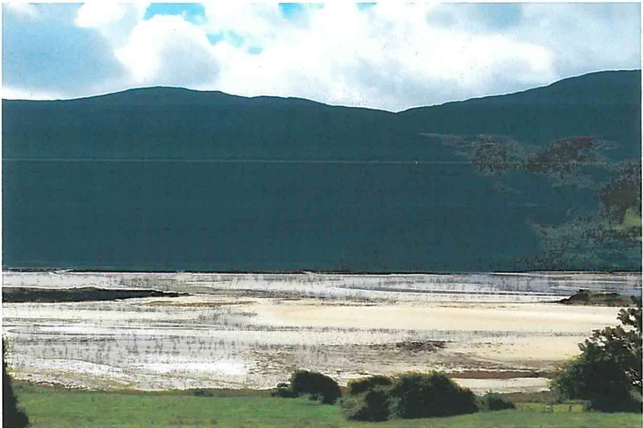
View of new trestles on the site of this Appeal. The view is from the Loughros Point Rad to the north of the site

The site is also clearly visible from the two public roads in the area - Loughros Point Road to the north and the Maghera Road to the south.